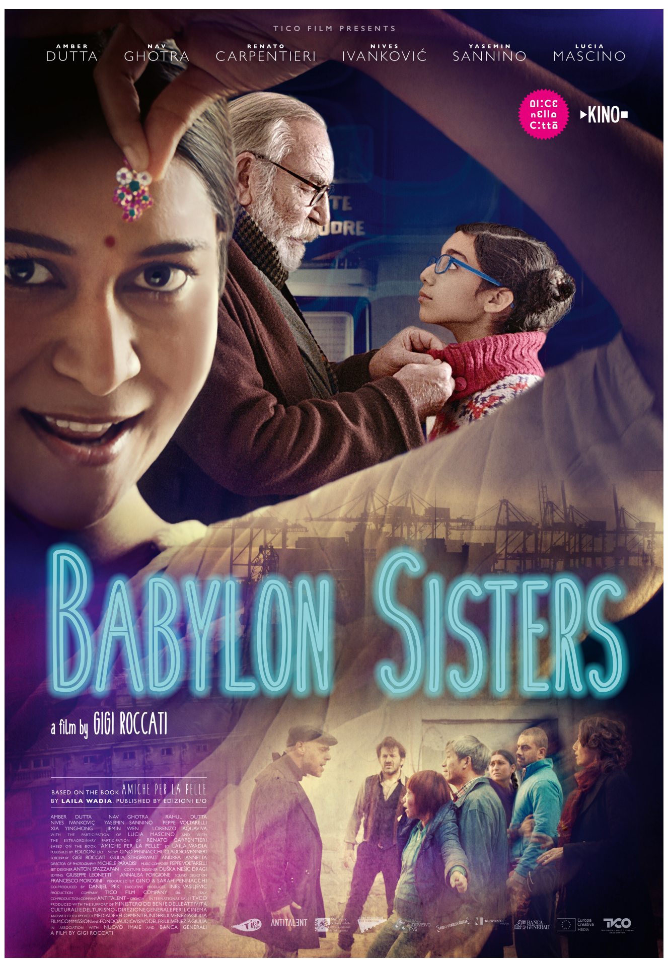
© Tico Film Company Srl – CREDITS NOT CONTRACTUAL